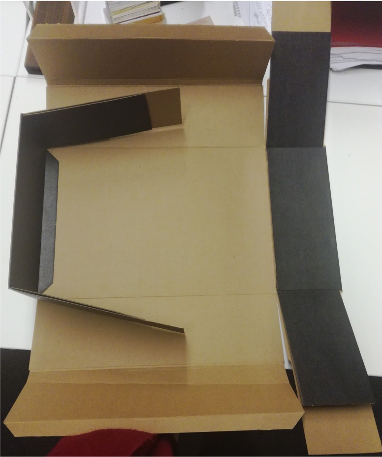
Step 1: Fold up short edge with flaps inside