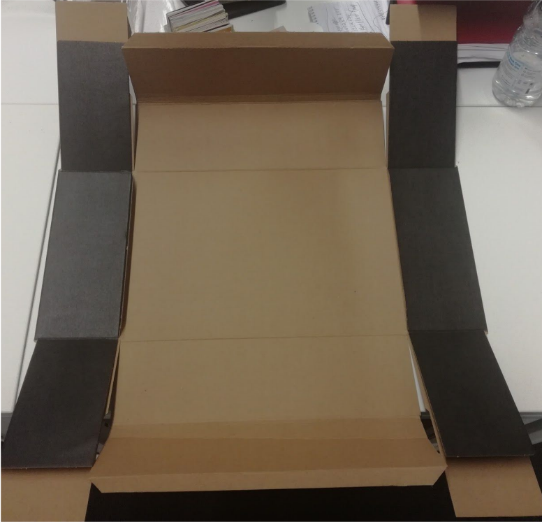
Start with your box