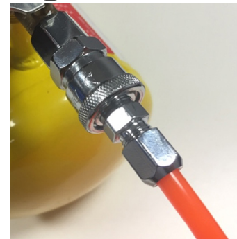
Image shows airline when fitted correctly